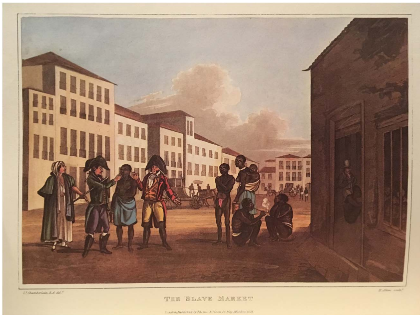
Figure 2. This plate, entitled “Slave Market” was originally painted by the British officer Henry Chamberlain (1796–1843), who visited Rio de Janeiro in 1819 and 1820. It depicts the surroundings of the Valongo, the famous docks where the Africans who survived the Middle Passage were sold in the markets as slaves. Around the commercial area of the Valongo and Rio’s waterfront, many of the stories discussed in this article unfolded. Chamberlain’s description reads: “The Plate represents an elderly Brazilian examining the Teeth of a Negress previous to purchase, whilst the Dealer, a Cigano, is vehemently exercising his oratory in praise of her perfections. The Woman looking on is the Purchaser’s Servant Maid, who is most frequently consulted on such occasions.”

Views and Costumes of the City and Neighbourhood of Rio de Janeiro, Brazil, from Drawings taken by Lieutenant Chamberlain, Royal Artillery, during the years 1819 and 1820, with descriptive explanations (London, 1822).